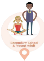
Secondary School & Young Adult

A website for parents and carers. Reliable and up-to-date resources on emotional health for your children.